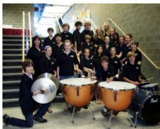
Ancaster Senior Public Concert Band

And we are grateful to the three local youth musical performance groups for sharing their time, talents and enthusiasm.