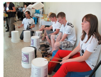
Barton Secondary School Drum Band