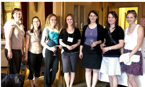
PREVNet Graduate Students attend the Wine and Cheese reception at McMaster's University Club

Networking opportunities for our Graduate Students and National Partners to share their work.