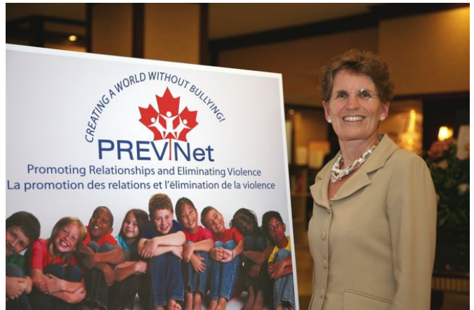
The Honourable Kathleen Wynne, Minister of Education, Government of Ontario