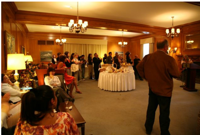
PREVNet's Networking Dinner held at the University Club of Toronto