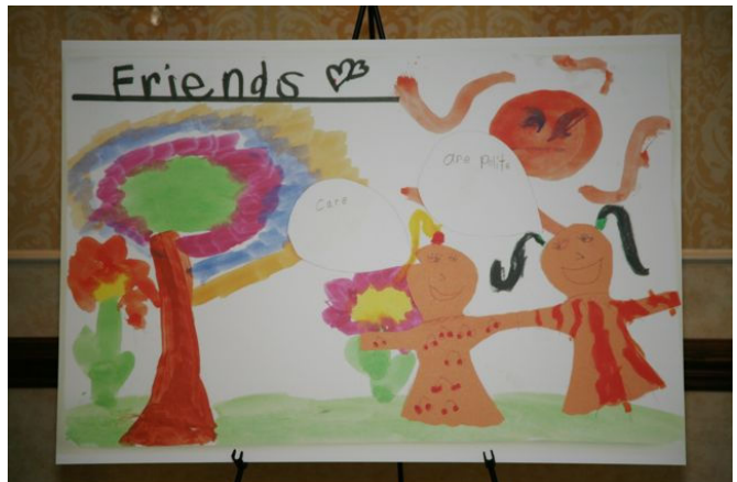
Artwork displayed at the conference courtesy of the children of Winston Churchill Elementary School