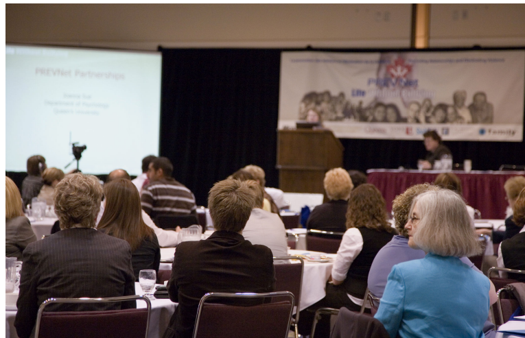
Participants at the PREVNet 4th Annual General Meeting and Conference held at the Metro Convention Centre in Toronto